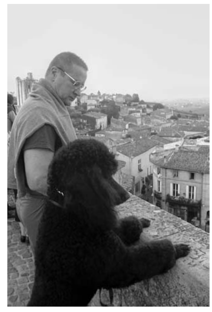
Kaiser takes in Saint Emilion